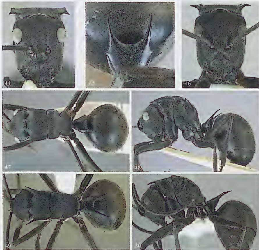
Figs 44-50. Polyrhachis spp. (44-45, 47-48): P. spinifera Stütz (syntype); (44) head in full face view; (45) petiole in frontal view; (47) dorsal view; (48) lateral view. (46, 49-50) P. tapini sp. n. (holotype); (46) head in full face view; (49) dorsal view; (50) lateral view. Not to scale.

foliage and vegetation (RJK acc. 84.206) (w, ♀); ditto, ex nest in rotting tree branch on ground (RJK acc. 84.208) (w, ♀); Central Prov.: 5 km NW of Brown Riv. For. Stn, 09°10'S, 147°12'E, <50 m, 6.ix.1984, ex nest in rotting log (RJK acc. 84.442) (w, ♀); Astrolabe Ra., Musgrove Riv. Valley, c. 350m, vi.1962, rf. (R.W. Taylor acc. 1844) (w).